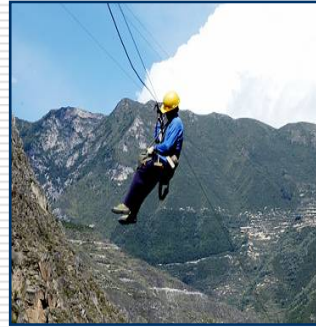
Strictly work and try for the best

4. Every citizen will get free access to mandatory telecommunication services