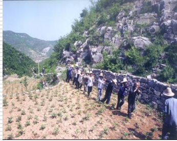
Local farmers assist in the construction spontaneously, hoping the project to be completed as soon as possible

- The Fund shall support the development and provision of public-utility tel. services in regions of VN where under the market mechanism, the relevant service-providing enterprises are unable to deliver service on a cost-effective basis. In so doing, the Fund shall support the execution of the Government's, the Prime Minister's, and the Post and Telematics Ministry's policies