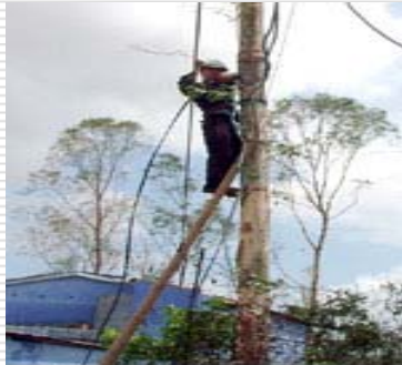
- Khôi phục TTL sau bão

- Being State Financial Organization, directly under Ministry of Post and Telematics (MPT).