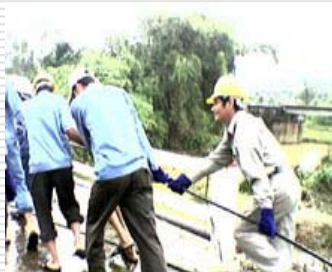
Triển khai mạng cáp viễn thông tại một tỉnh miền Trung

- Provide financial assistance to appropriate tel enterprises under two main types of support programs: