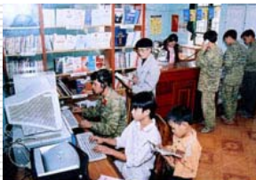
Người dân đến xem sách báo miễn phí và sử dụng các dịch vụ bưu chính, viễn thông và CNTT ở các điểm BD-VH xã

Funding resources: contributions made in proportion to the revenues from those service provision (excluding connection charges)